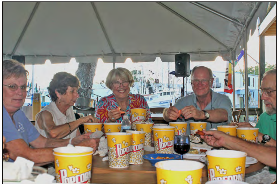
Popcorn Party? No - at the Shrimparoo, each person got two cups, one full of fat, flavorful, delicious shrimp and another cup for shells.